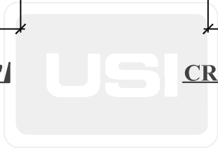
CROSS SECTION 'B'